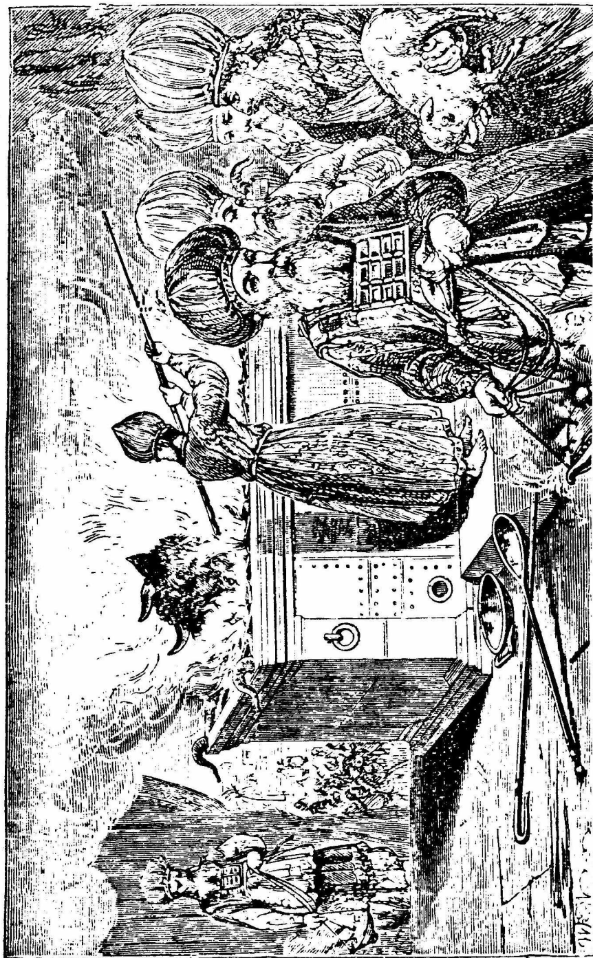
RENEWAL OF JEWISH SACRIFICES IN REBUILT TEMPLE AT JERUSALEM, ABOUT NOVEMBER 14, 1901; WHICH WILL ALSO BE THE DAY OF THE COMMAND TO REBUILD JERUSALEM, AND WILL BE 69 WEEKS BEFORE MESSIAH'S ADVENT (EXPECTED ABOUT MARCH 12, 1903), AND WILL ALSO BE 2345 DAYS BEFORE APRIL 16, THE FIRST DAY OF PASSOVER WEEK (APRIL 16 TO 23) 1903, WHICH ENDS THIS AGE. DANIEL viii. 14; ix. 25.