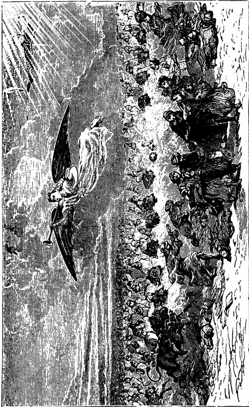
SECOND WOE: PLAGUE OF 200 MILLION LION-HEADED FIRE-BREATHING DEMON HORSES FROM THE BOTTOMLESS PIT, BESTRIDEN BY DEMON CAVALRYMEN, KILLING THE THIRD PART OF MANKIND DURING 391 DAYS FROM DEC. 29, 1905, TO JAN. 24, 1907, AND THEN PROBABLY HURTING THE SURVIVORS DURING ANOTHER 391 DAYS UNTIL FEB. 19, 1908.—REV. ix. 13 TO 19.