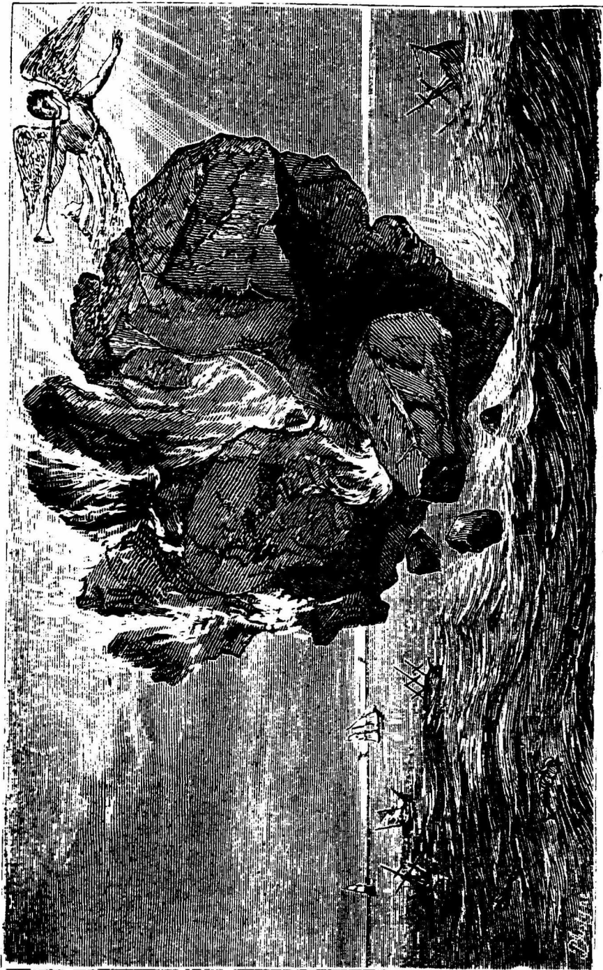
A BURNING MOUNTAIN CAST INTO THE SEA: A THIRD PART OF IT BECOMES BLOOD, AND A THIRD PART OF THE FISH IN IT DIE, AND A THIRD PART OF THE SHIPS IN IT ARE DESTROYED—DURING FEBRUARY, MARCH, APRIL, AND THE FIRST THREE WEEKS OF MAY, 1904.—Revelation viii. 8, 9.