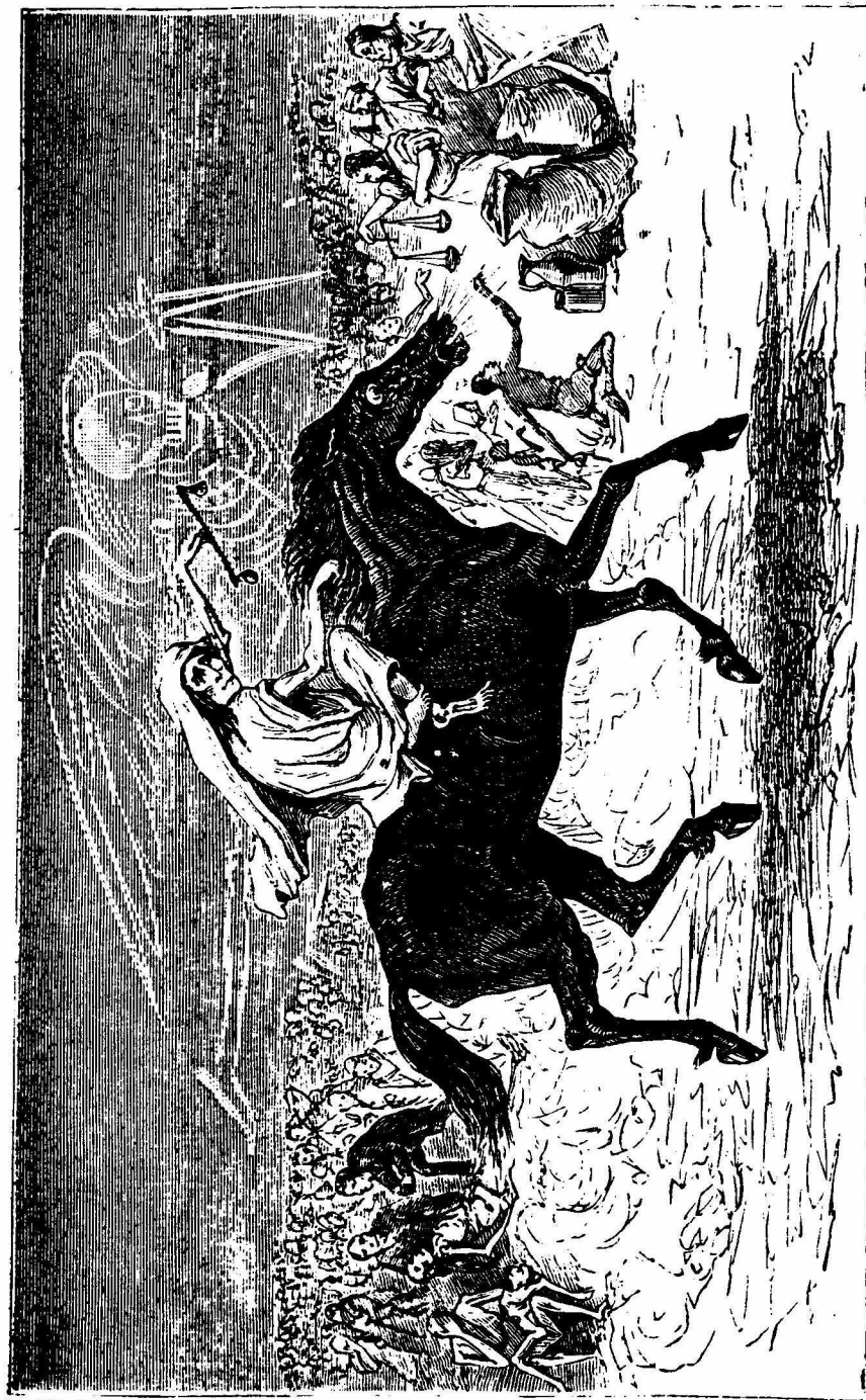
THE BLACK HORSE OF FAMINE: GREAT SCARCITY OF FOOD: A CHENIX (3 HALF-PINTS) OF WHEAT COSTING TEN TIMES THE USUAL PRICE, — DURING 17 MONTHS FROM AUG. 1904 TO JANUARY. 1906. — Rev vi. 5, 6.