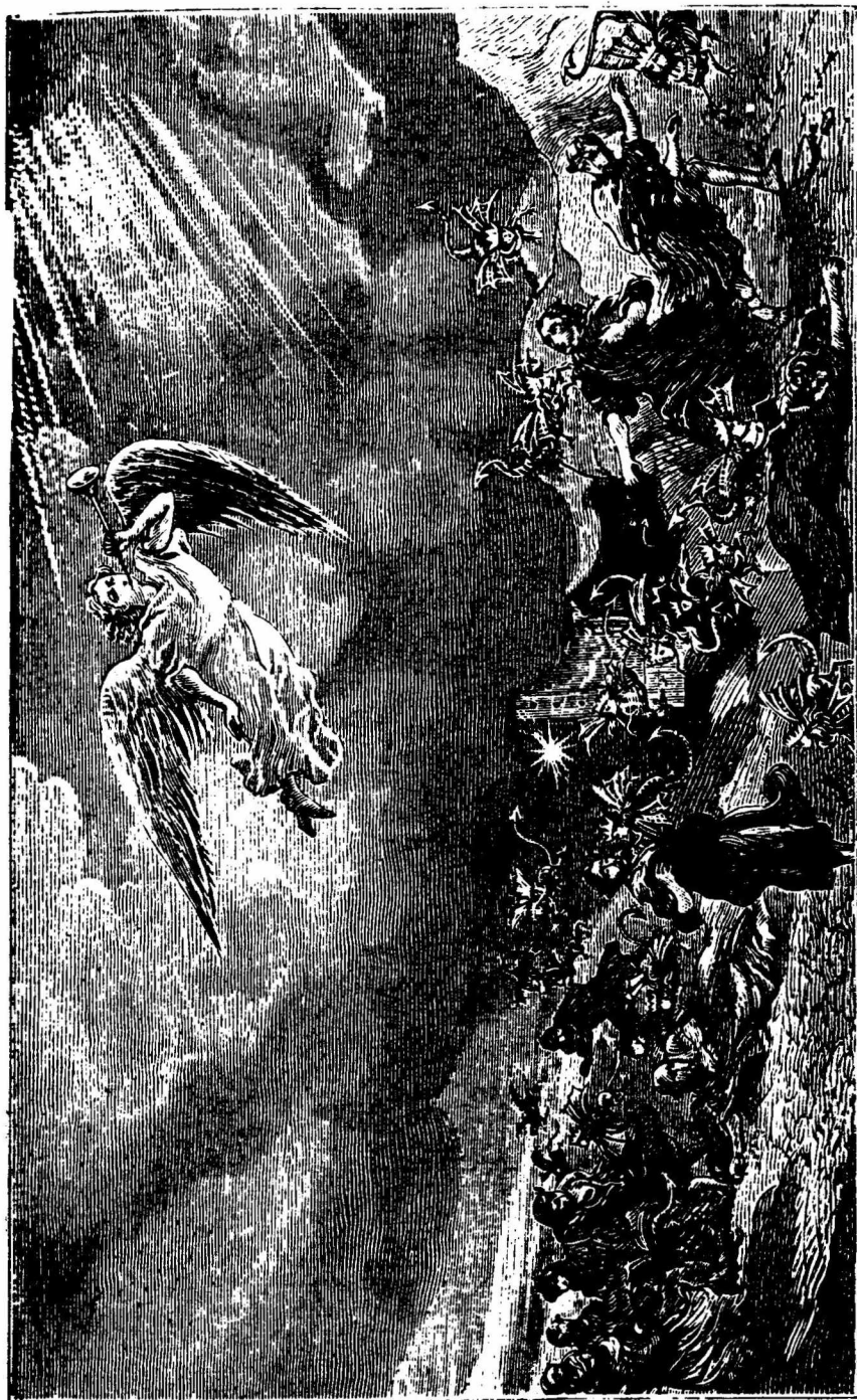
FIRST WOE: PLAGUE OF DEMONS FROM THE BOTTOMLESS PIT IN THE FORM OF LOCUSTS WITH SCORPION STINGS TORMENTING UNGODLY MEN FOR 150 DAYS FROM OCT. 27, 1904, TO MARCH 26, 1905, AND THEN HURTING THEM FOR 150 DAYS UNTIL AUGUST 23, 1905.—REV. ix. 1-12. SMOKE FROM THE PIT WILL FIRST DARKEN THE SKY DURING ALL OCTOBER, 1904.