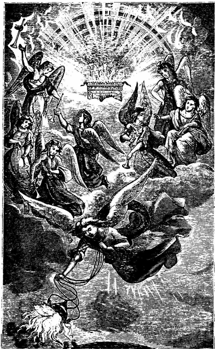
SEVEN ANGELS WITH THE SEVEN TRUMPETS, AND ANOTHER ANGEL CASTING FIRE ON THE EARTH, WHEREUPON THERE ARE VOICES AND THUNDERINGS AND LIGHTNINGS IN AUGUST, 1903, AND EARTHQUAKE SHOCKS ABOUT THE LAST WEEK OF SEPTEMBER AND FIRST WEEK OF OCTOBER, 1903. Revelation viii. 2—6.