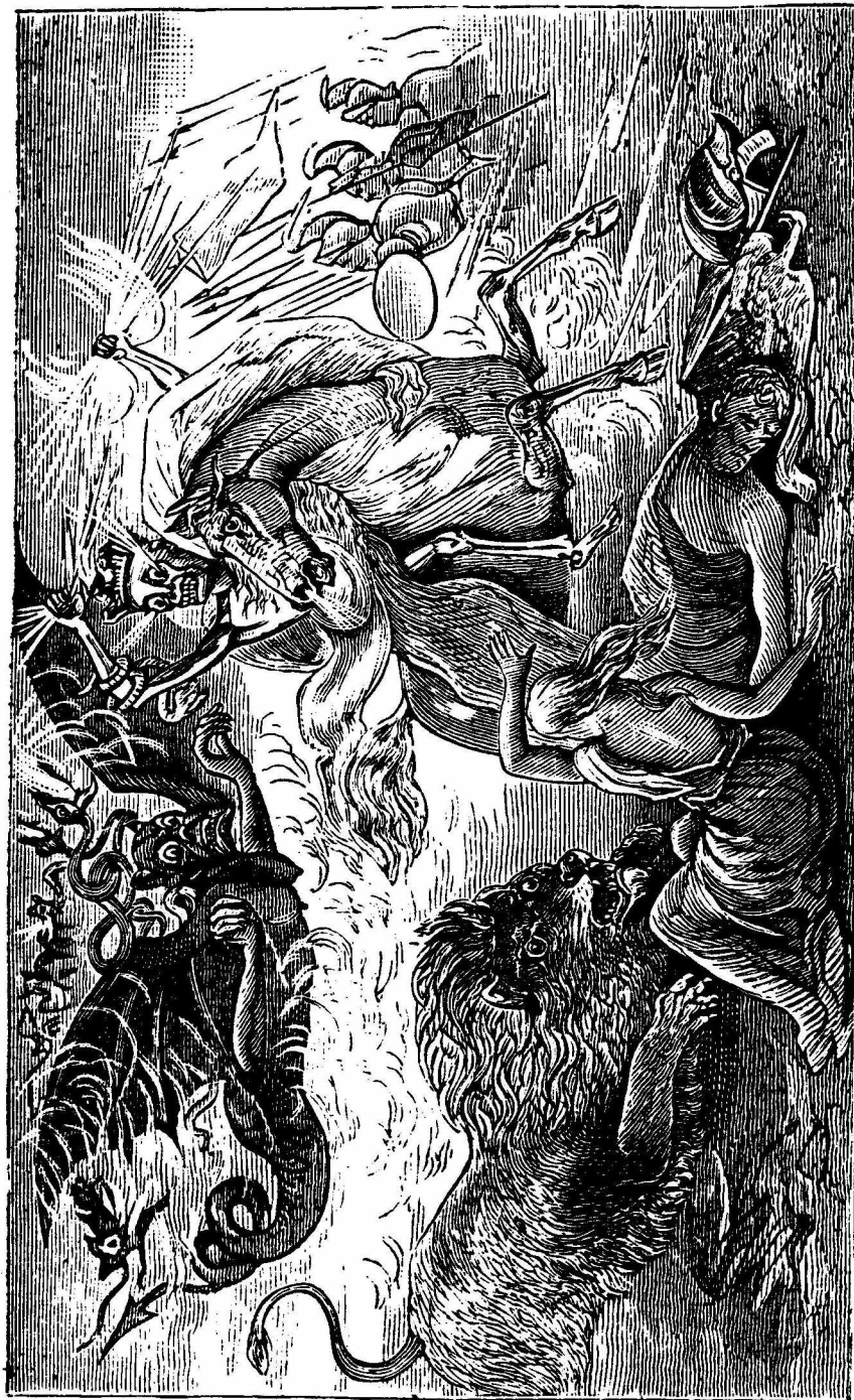
DEATH ON THE PALE HORSE WITH HADES FOLLOWING, KILLING THROUGHOUT THE FOURTH PART OF THE EARTH WITH THE SWORD AND HUNGER AND PESTILENCE AND THE WILD BEASTS. DURING 16 MONTHS FROM JAN. 1906 TO MAY, 1907. — REV. VI. 8.